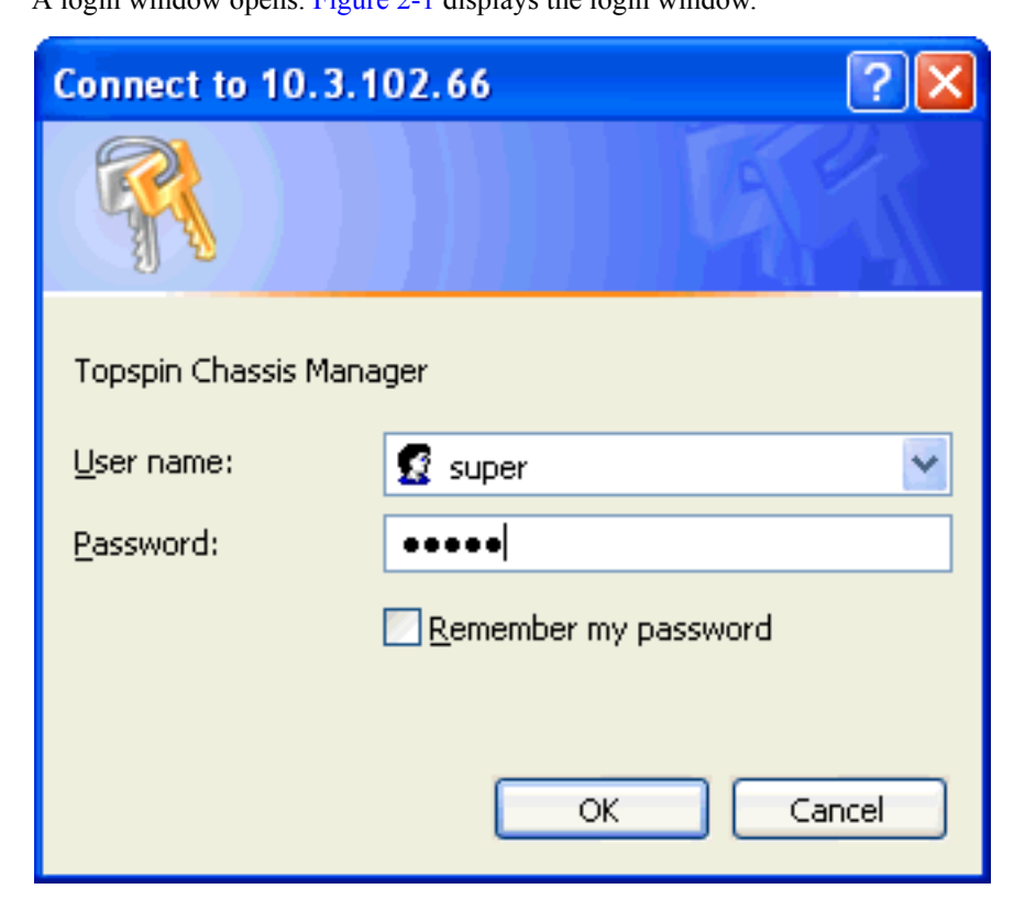
Figure 2-1: CM Login Window

3. Enter your Server Switch user name and password in the login window and click the OK button. CM loads in your browser window.